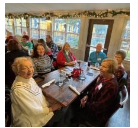
Vincent's Coppertop Restaurant provided the perfect venue for our party.

It was our treat to gift Union County's hard working staff with gift certificates at Christmas. Another favorite of ours is to present a Christmas story picture book to the children at Story time.